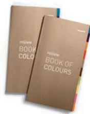
ROYALE BOOK OF COLOURS