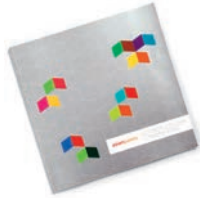
INTERIOR COLOUR COMBINATIONS GUIDE