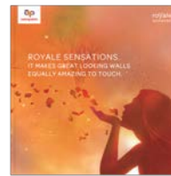
ROYALE SENSATIONS BOOK