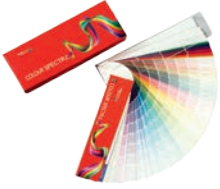
COLOUR SPECTRA FAN DECK*